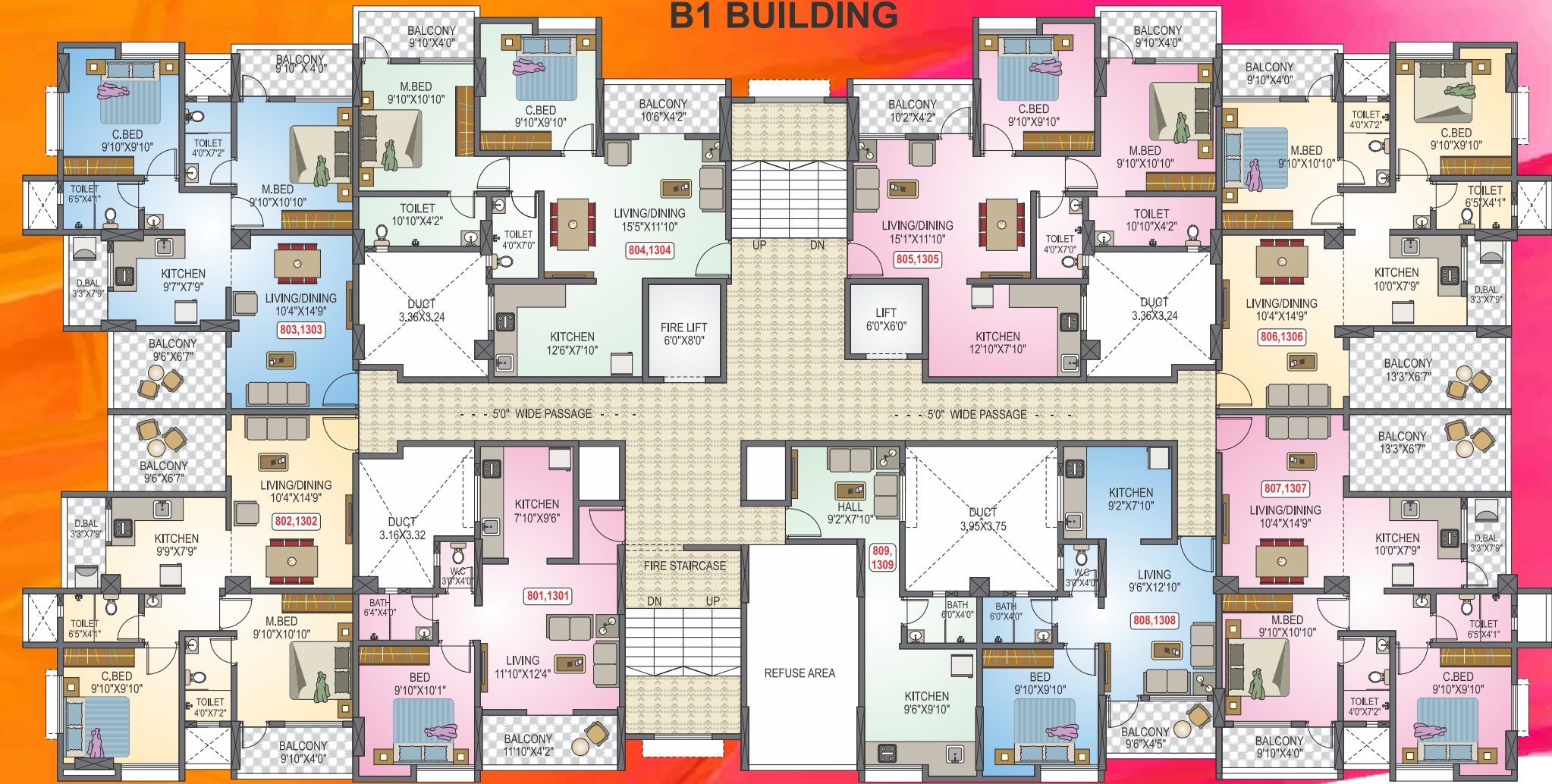
EIGHT & THIRTEENTH FLOOR PLAN